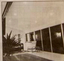
An interior addition TALLstudio designed in Ocean Springs.